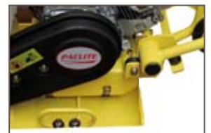
Low hand/arm vibration