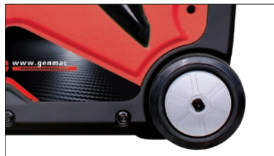
Kit Trolley solo su modello GR3000iN Trolley kit, only for model GR3000iN